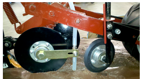
IH Fertilizer Disc shown with the optional Furrow V Closer