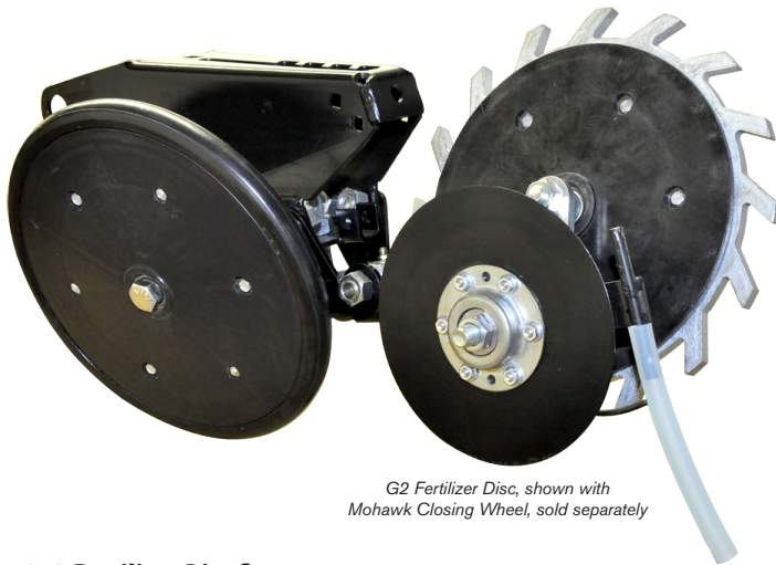
G2 Fertilizer Disc, shown with Mohawk Closing Wheel, sold separately

pivots in the middle where it is attached to the press wheel bracket where the wheel was taken off, so that a constant down pressure can be maintained on the closing wheels. The liquid disc breaks side wall compaction so the press wheel crumbles soil down around the seed pressing it in tight. The liquid attachment can be mounted on newer style staggered closing wheel brackets. The press wheel is moved back on the walking beam only 7". This low cost, easy to mount fertilizer disc can reduce your fertilizer cost and waste.