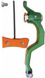
NEW Gauge Wheel Arm