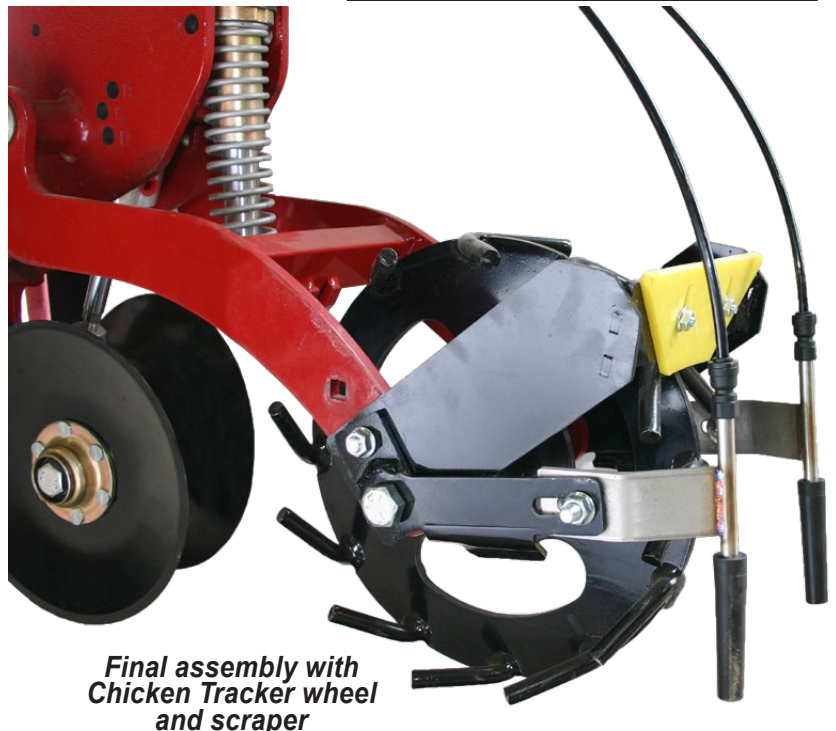
Final assembly with Chicken Tracker wheel and scraper