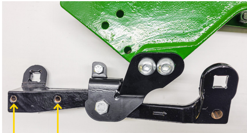
bolt weight here

This weight bracket takes place of the fertilizer disc to keep the walking beam from dropping down in the front when planter is raised up.