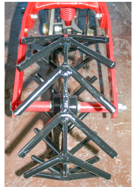
6" Chicken Tracker fig. (c)