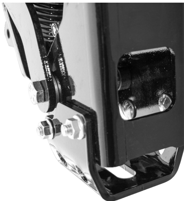
carriage bolts & whiz nuts

STEP #1: Line the closing wheels mounting bracket up over the bottom of the 4 Link Closer. Secure in place with the four 3/8" carriage bolts.