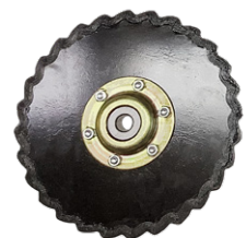
9" SERRATED STP