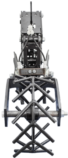
6" Chicken Tracker