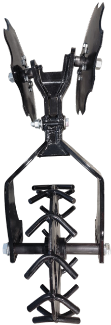
4" Chicken Tracker