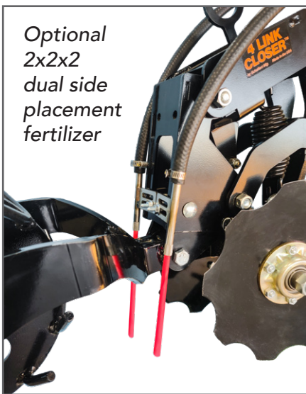
Optional 2x2x2 dual side placement fertilizer