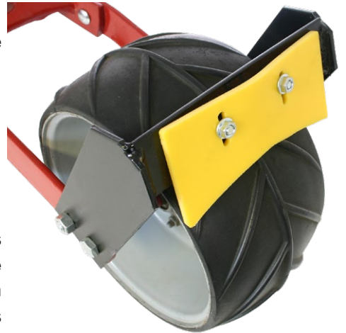
Case IH press wheel scraper