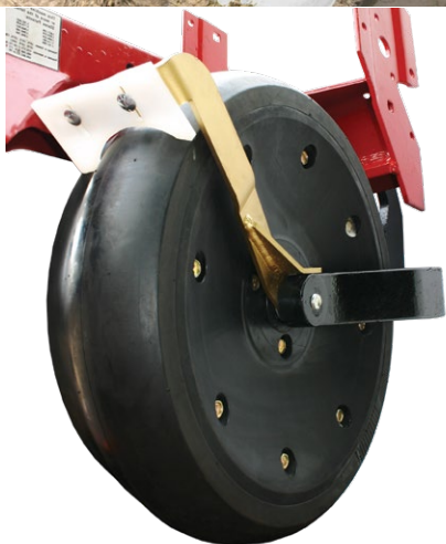
Case IH 1200 gauge wheel scraper