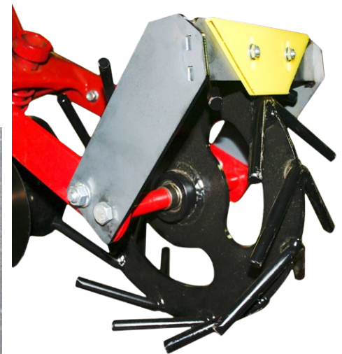
Chicken Tracker scraper