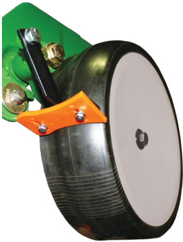
John Deere, Kinze & White gauge wheel scraper

Scraper easily flips out of the way when not in use.