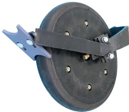
John Deere 455 press wheel scraper

The gauge wheel scraper easily welds or bolts onto most planters and once the wheel scraper is installed, with a one wrench design, it will conveniently flip out of the way when you are not using it.