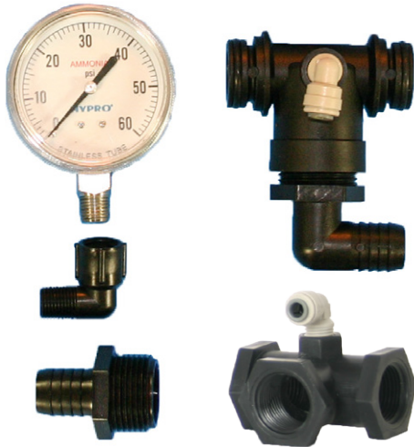
Pressure gauge assembly options

Pressure gauge is pre-assembled and built into the manifold.