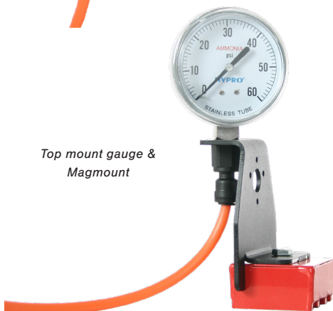
Top mount gauge & Magmount