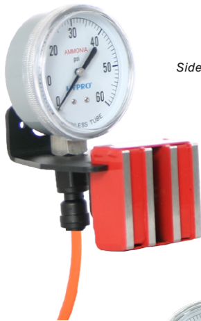
Side mount gauge & Magmount

The bracket is adjustable so that the Magmount can be placed on the top or the side of a metal frame.